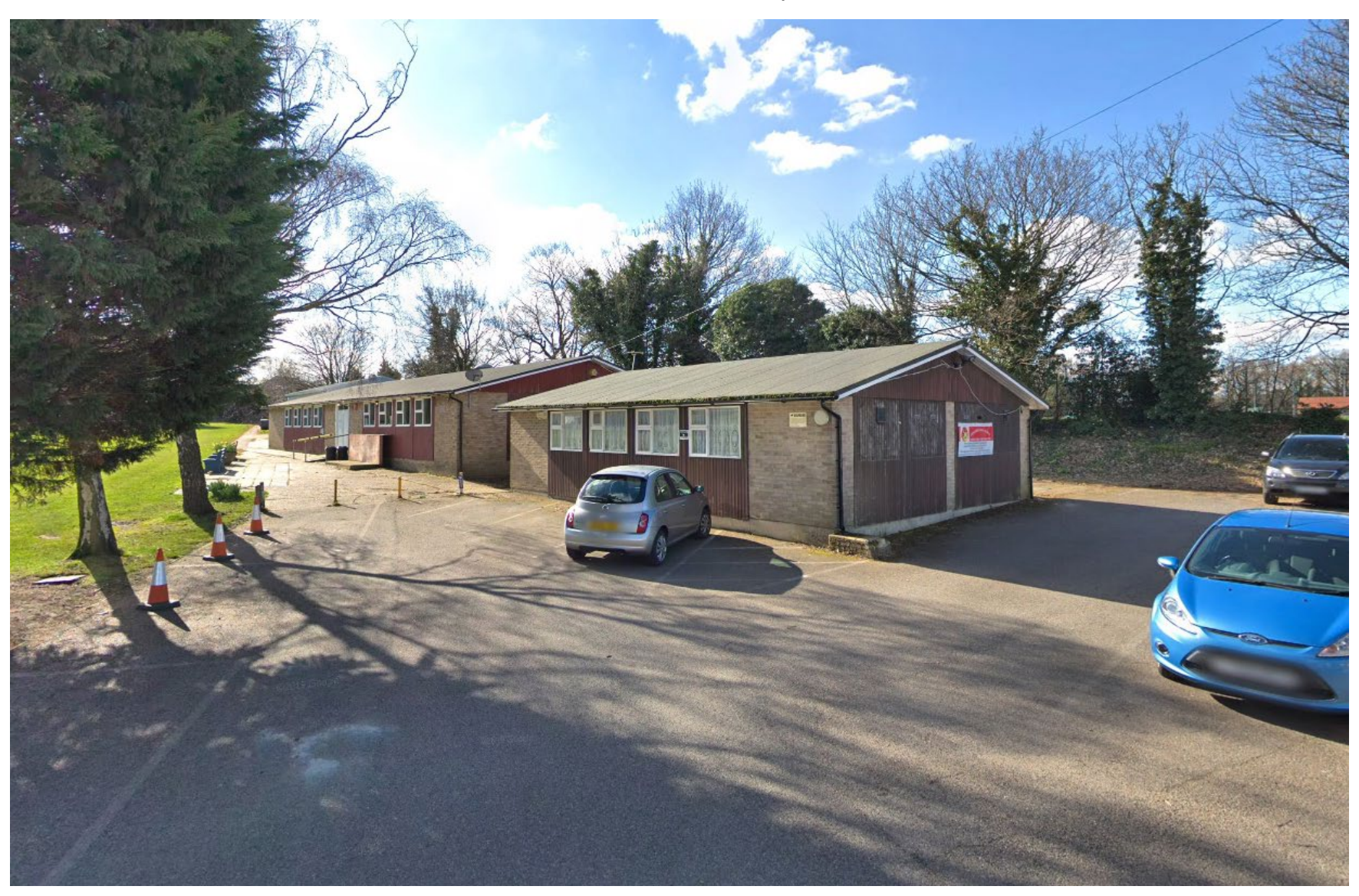
Street View Wickham Park Sports Club